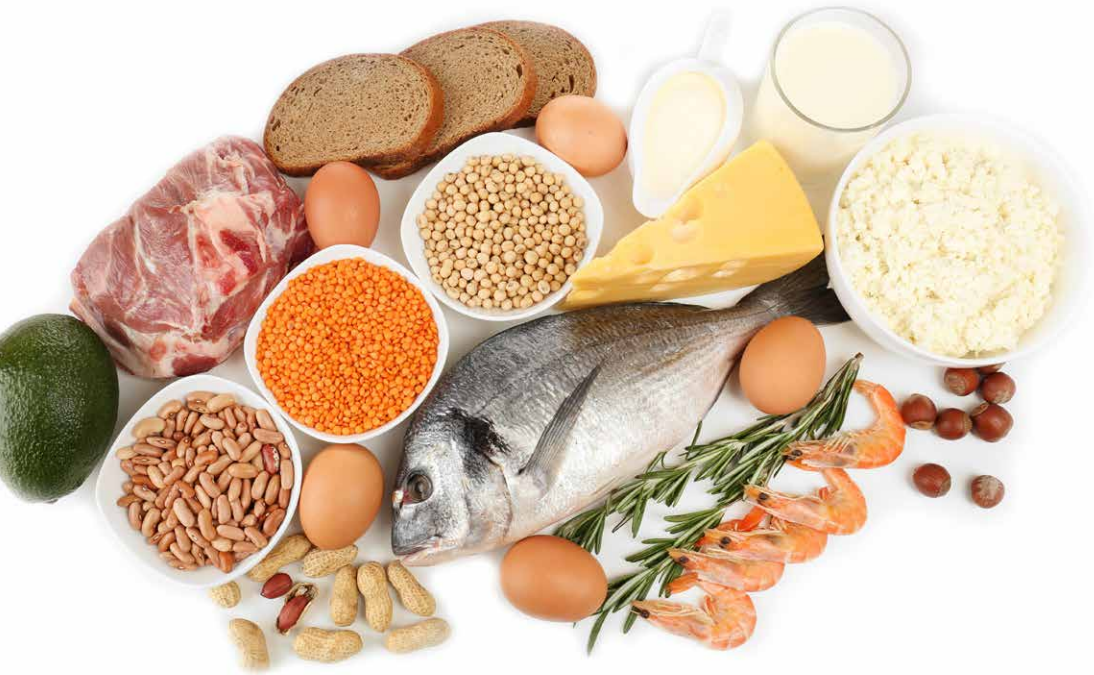
Table 7: DAILY PROTEIN RECOMMENDATIONS

Protein has always been a particularly popular nutrient with athletes because of its role in building and maintaining muscles. Indeed, athletes need to consume a wide variety of high-quality protein foods in their diets. However, while protein is necessary for rebuilding and repairing muscles, it is not the primary fuel, and consuming more protein than what the body can use is not going to give athletes larger and stronger muscles. While research shows that protein requirements are higher for athletes to aid in muscle repair and growth, most athletes are already consuming more protein than the body can use. Use the following formulas as guidelines to ensure proper amounts of protein are included in your dietary intake.