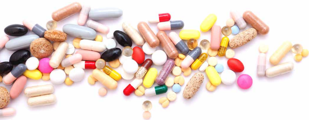
Table 11: MICRONUTRIENT SOURCES

Athletes should always choose food over dietary supplementation. The body needs more than 40 nutrients every day and supplements do not contain all the nutrients that are found in food. Supplements cannot make up for a poor diet or poor beverage choices.